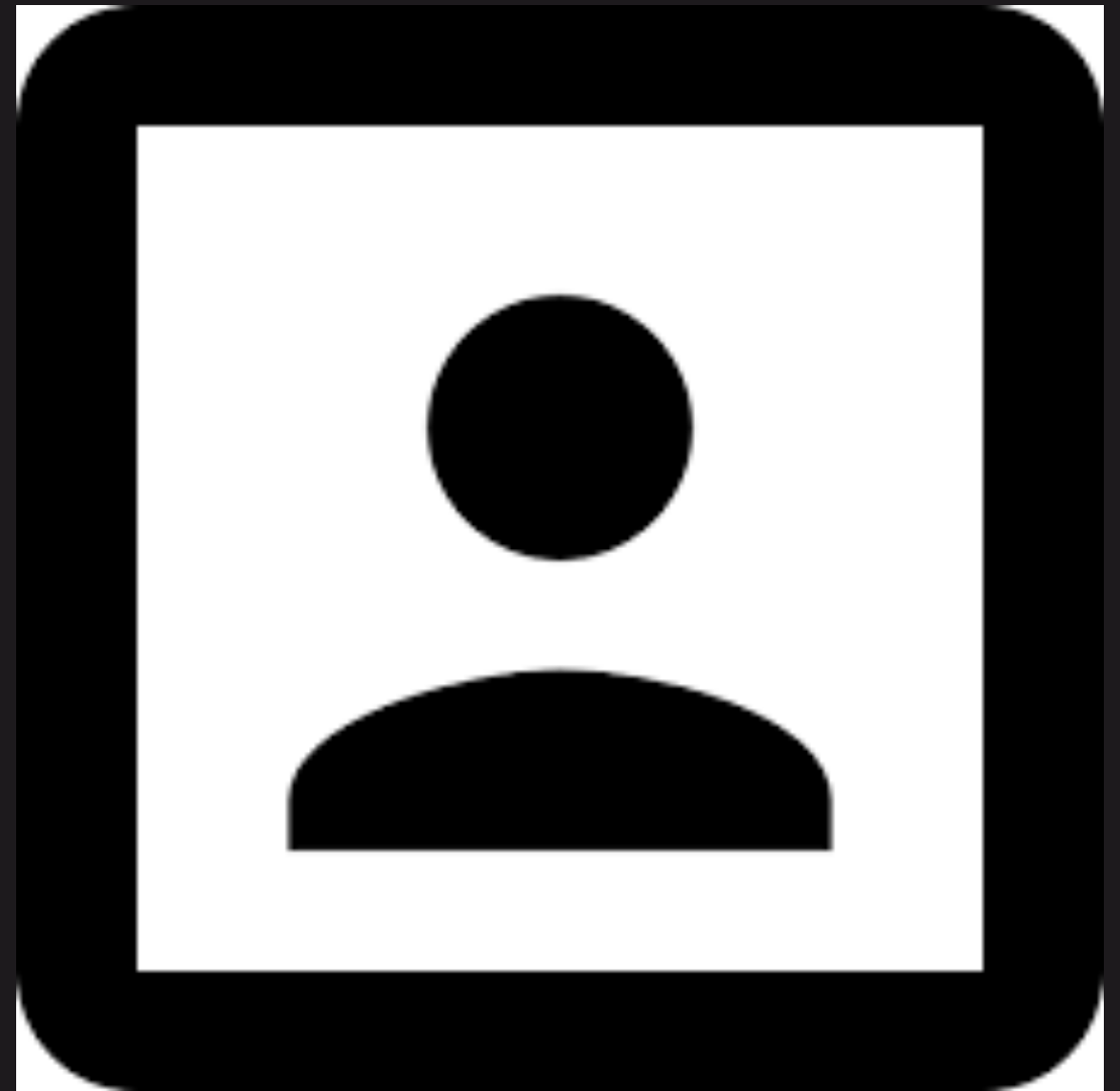
Picture of God