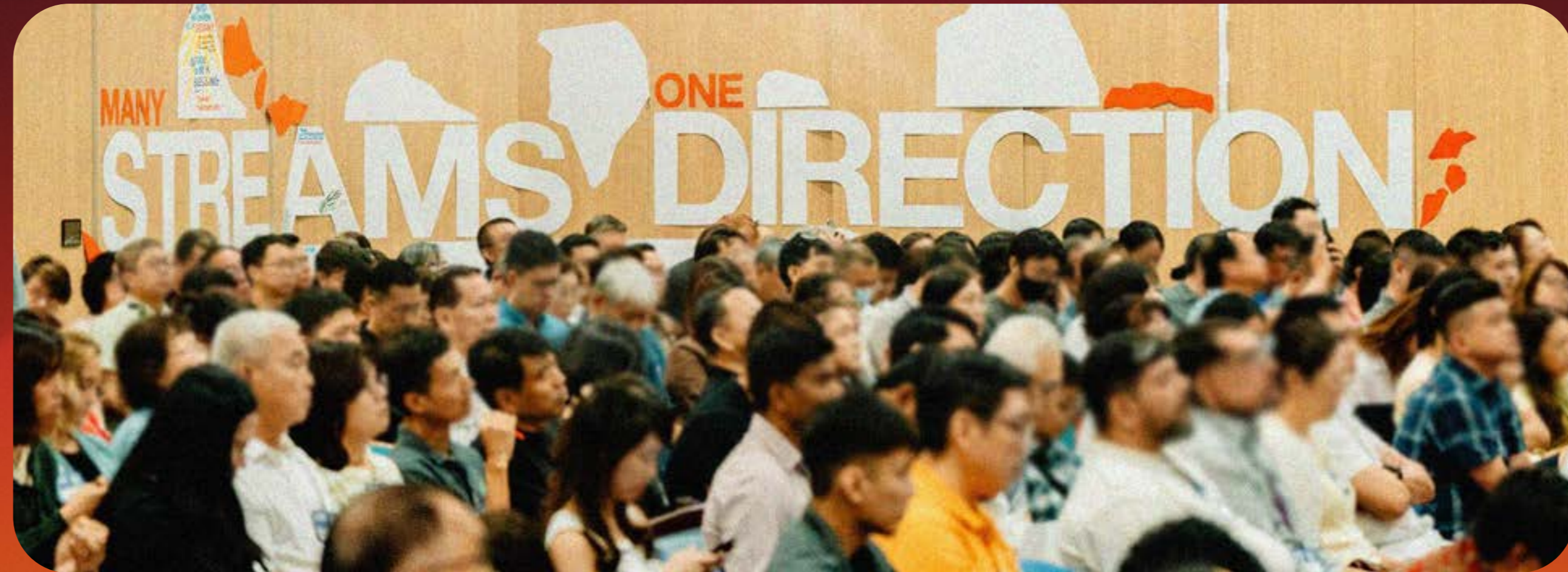
Antioch Summit 2024