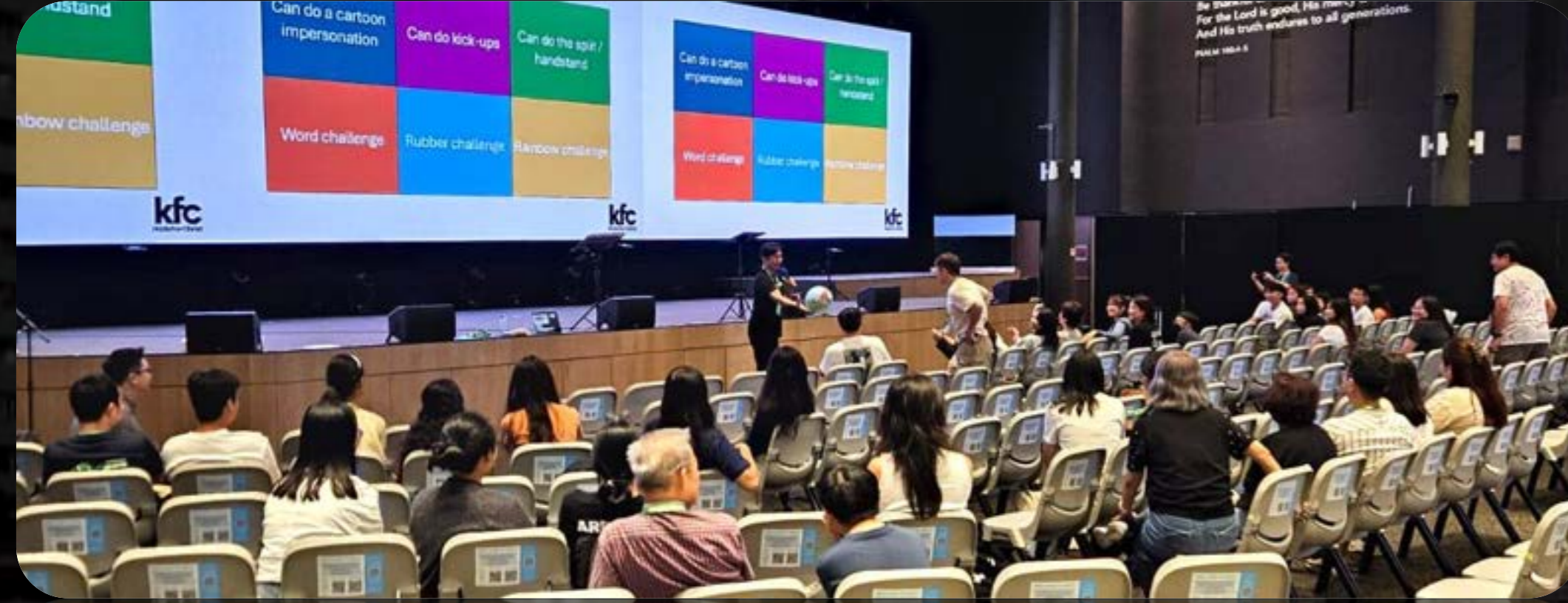
Kids For Christ Volunteers Appreciation