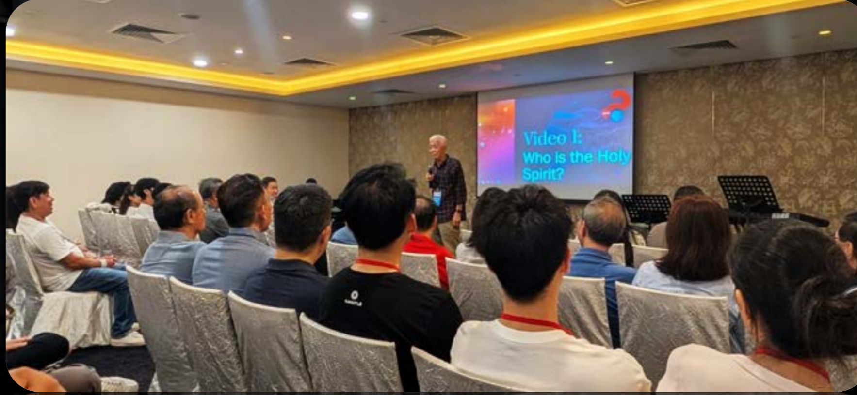
Alpha Weekend Away