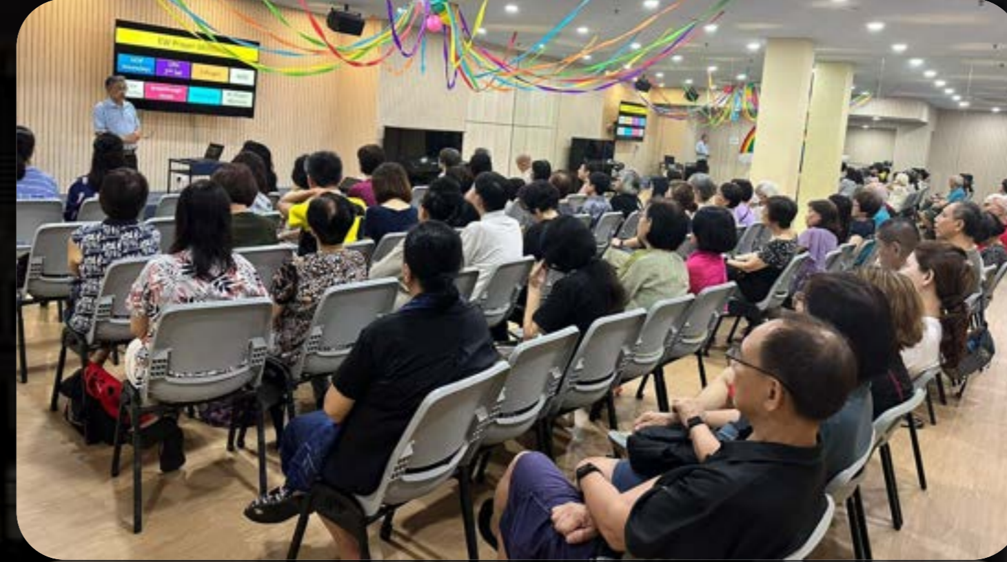
Prayer Partners Gathering